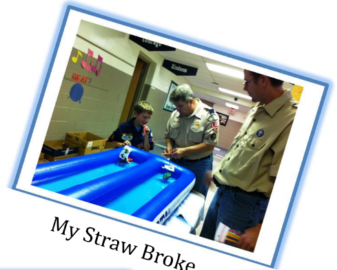
My Straw Broke