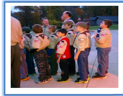
Webelos II Flag Ceremony Great Job!!!