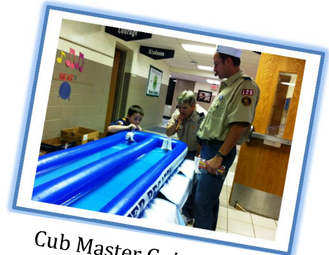
Cub Master Going Down